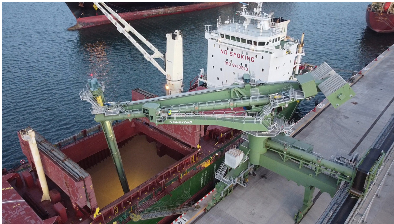
STATIONARY & RAIL-MOUNTED UNLOADERS